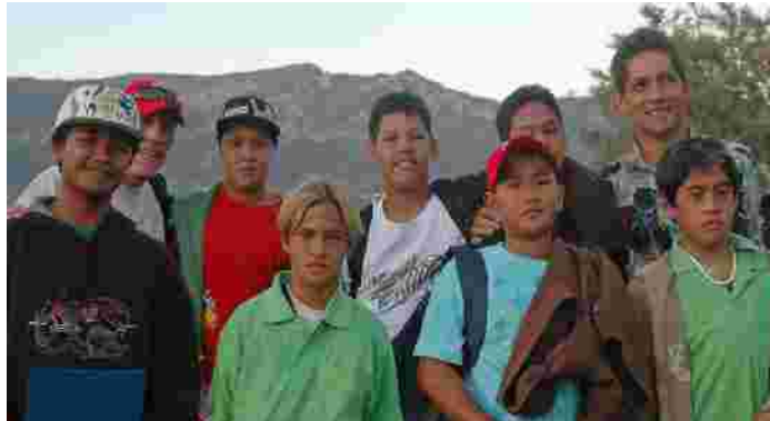
Thanks To Those Who Make Summer Cup Happen

Tournament Director, Santa Barbara Soccer Club